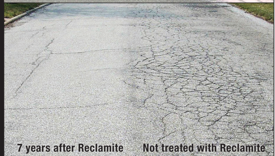
7 years after Reclamite