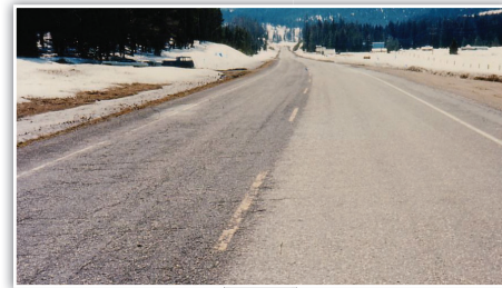
Yellowstone National Park archived photo. Unsealed pavement on the left, sealed pavement with Reclamite on the right.

True maltene-based rejuvenators are different. "Consider asphalt binder," Durante says. "The binder (pen or PG grade) will have heavy black materials in it called asphaltenes, and light oils and resins called maltenes. The maltene-based rejuvenator, which is the only true type of rejuvenator, is a blend of four maltene fractions with no black color to them, because it does not contain asphalt. Unlike asphalt emulsions, that protect and add binder to the surface, the maltene emulsion rejuvenator penetrates into the surface and combines with the weathered and oxidized asphalt binder holding the aggregate. It softens it, or changes its viscosity and durability."