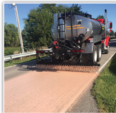
Tippecanoe County, Indiana.

“Maltene-based rejuvenators may offer a low-cost and effective pavement preservation treatment when applied correctly on pavements in newer condition, or in the mid-to-higher PCI range,” FP 2 reports in its Preservation Toolbox online.