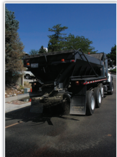
After rejuvenator placement, a light coating of sand is applied to enhance friction.

The City of Visalia's goal was to maintain the high street PCIs shown by its pavement management system program by using a lower cost treatment, which would extend pavement life four to five years. Application of an asphalt emulsion-based rejuvenator has led to increased PCIs on Visalia streets, while the city has raised the level of public awareness of pavement preservation through an in-house media promotion.