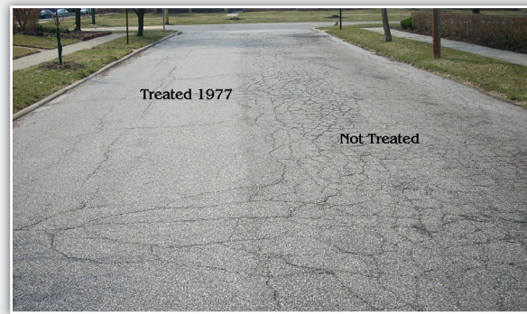
After 32 years, the 2009 photo shows performance of 1977 maltene-based rejuvenator emulsion-treated pavement in Cleveland, Ohio.